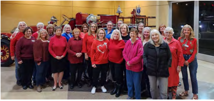
At their February meeting, GFWC Cartersville Woman's Club members wore different shades of red to commemorate American Heart Month and took a group photo in front of a very red fire truck. The Health and Wellness CSP held a raffle for a Valentine-inspired basket, with proceeds donated to the American Heart Association.