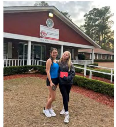
The GFWC Sylvania GEMS delivered Valentines to the nursing home residents of Syl-View Health Care Center.