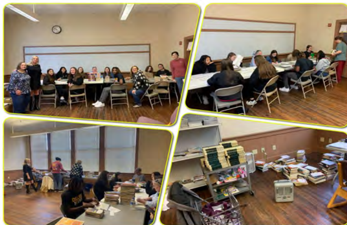
In February, GFWC Sylvester Woman's Club , along with the local Beta Club, labeled books donated by the community to get for City of Sumner Library up and running.

along Sustella Avenue to in a effort of create a greener, healthier, and more vibrant Valdosta for all to enjoy.