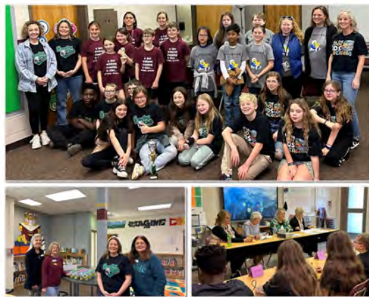
GFWC Dawson County Woman's Club helped provide snacks for the team members and coaches at the Reading Bowl at Robinson Elementary School in February.

Hart County Community Theater at the February meeting. These members volunteered their time at HCCT throughout 2023.