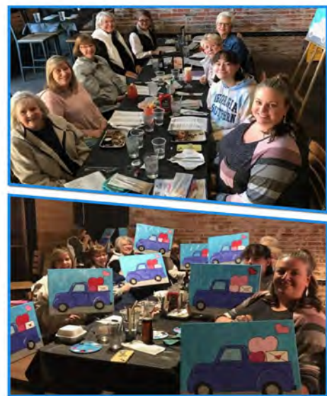
Members of the GFWC Vienna Woman's Club had dinner and attended a paint party on February 6 at the RailHouse Tavern. Look at all those entrants into next year's Member Arts Contest!