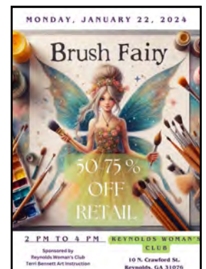
The GFWC Reynolds Woman's Club sponsored a Brush Fairy, an art brush sale in January. This deeply discounted 2-hour sale was a chance for all art lovers in the area to stock up on quality brushes at reasonable prices.