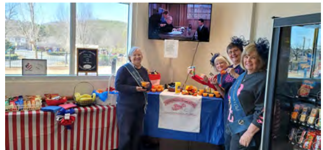
February for the GFWC Georgia Marietta Woman's Club began with a request from the Atlanta Veterans Administration office, requesting assistance with Veteran Patient Appreciation Day the following week. The club said yes and were assigned the West Cobb V.A. Medical Clinic. Club women donated a car full of fresh fruit, granola bars and assorted treats and made thank you signs. Several happy club ladies had the privilege of spending Valentine's Day afternoon visiting with patients, thanking them for their service and handing out healthy treats. The donations were so abundant that they were able to share the Valentine's love around with thank yous, snacks, and hugs to the next door police precinct, the regional library and a neighborhood fire station. Sometimes the last minute opportunities to volunteer are the most rewarding!