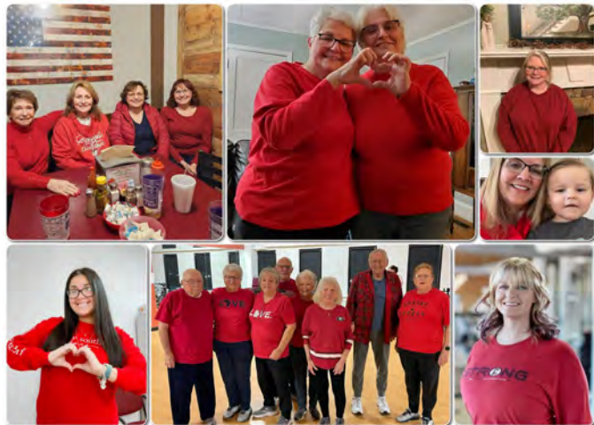
The GFWC Cartersville Woman's Club and some friends showed support for "National Wear Red Day" on February 2, 2024 as they went about their daily lives.