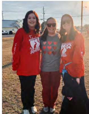
Three members of the GFWC Sylvester Woman's Club participated in the I Walked the Red Mile for heart