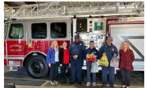
In February, the GFWC Cochran Woman's Club took healthy snack and treats (and some sweets) to the Cochran Fire Department and got to see the new fire truck for Cochran.