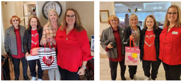
Members of the GFWC Cartersville Woman's Club delivered 344 member-created Valentines, along with socks and chocolate candy to the seniors in 7 local nursing homes and assisted living facilities.