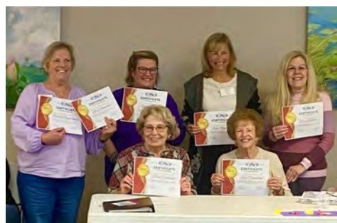
Several members of the GFWC Hartwell Service League were recognized for their support of the

Hart County Community Theater at the February meeting. These members volunteered their time at HCCT throughout 2023.