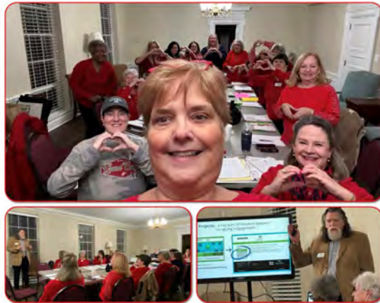
The GFWC Gainesville Phoenix Woman's Club honored Women's Heart Health at their February meeting by wearing red. They also learned about the Wisdom Project 2030 and what they do in their community.