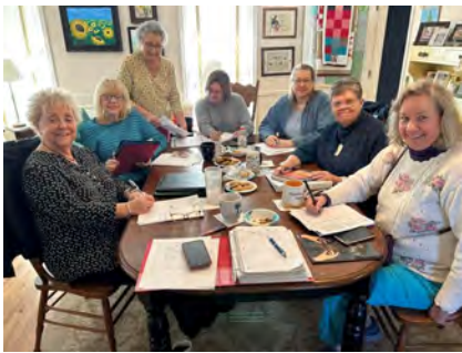
Report Writing Is Fun! The GWFC Tifton Woman's Club held their annual report writing "clinic" on Saturday, January 13th, where they reviewed their projects for the past year and determined who would write each report, thus "spreading the love" and avoiding "report fatigue!" "