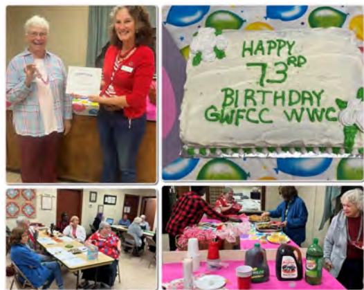
The GFWC Woodbine Woman's Club celebrated their 73rd Birthday at their