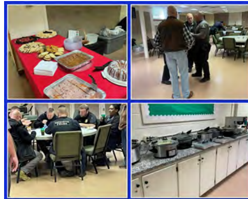
The Civic Engagement & Outreach CSP of the GFWC Lafayette Woman's Club recognized and honored law enforcement from

the City of LaFayette, Walker County, and Georgia for National Law Enforcement Appreciation Day. They served approximately 60 officers - soups, stews, cornbread, and tasty desserts.