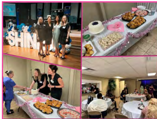
The GFWC Sylvester Woman's Club assisted at the 2024—Night to Shine prom at Unity Baptist Church on February 9th for individuals with special needs ages 14 and older.