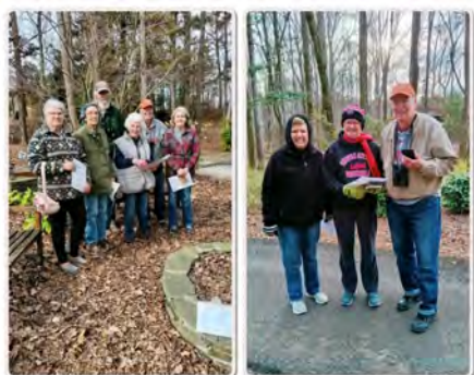
GFWC Hartwell Service League members along with other organizations in the community participated in the Backyard Bird Count, the annual worldwide bird