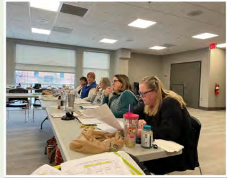
GFWC Gainesville Phoenix Woman's Club members met at the Hall County Library on January 6th for their annual Retreat to brainstorm and plan activities and projects for 2024.