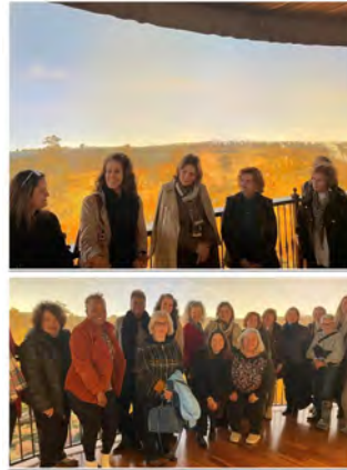
The Arts and Culture CSP of The Atlanta Woman's Club hosted a tour of the Cyclorama at the Atlanta History Center. The painting was created in 1886 and relocated to Atlanta in 1892. It was placed in Grant Park in 1921 and later transferred to the Atlanta History Center for long term preservation and opened in 2019. An Atlanta History archivist shared details about the restoration of the painting with club members.