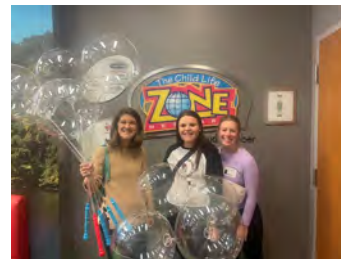
The GFWC Roswell Cares Service League hosted a fun craft party for 20 children at the Children's Hospital at Scottish Rite. Each child received a balloon, made a craft, and left with a smile. This is a monthly event for the club.