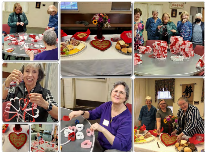
The GFWC Morrow Civic Woman's Club made special hanging valentines for the residents of River Place Assisted Living at their first project/meeting night in February. They also celebrated their special birthday buddies with a Valentine birthday cookie and delicious snacks.