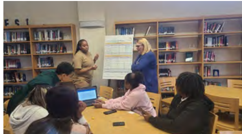
The Civic Engagement and Outreach CSP of The Atlanta Woman's Club is partnering with The Scholarship Academy (TSA), a local non-profit that teach future college students how to pursue college without having to take on crippling debt. The Atlanta Woman's Club facilitated a "Cost of College" session for the young ladies (seniors) at Coretta Scott King Young Women's Leadership Academy on January 25th. The young ladies researched, calculated, and began their strategies to pay for college without debt.