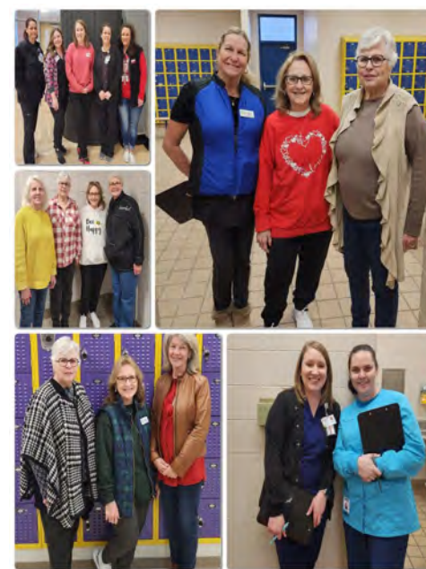
GFWC Cartersville Woman's Club members assisted once again the Bartow County Health Department nurses in their scoliosis screening of 6th and 8th grade students at 5 middle schools.