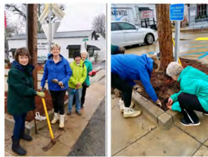
Braving the rain, the Environment CSP of the GFWC Hartwell Service League planted 50 daffodil bulbs in late January in honor of the club's 50th anniversary in 2024.