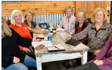
Members of the Civic Engagement and Outreach CSP of the GFWC Hartwell Service League met in January to make plans for 2024. One project fulfilled was donating 50+ items to the Hart County Food Pantry in honor of the upcoming 50th Anniversary of the GFWC Hartwell Service League!