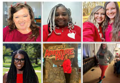
Members of the GFWC Toccoa Junior Woman's Club were in different places, but still wore red for "National Wear Red Day" on February 2nd.