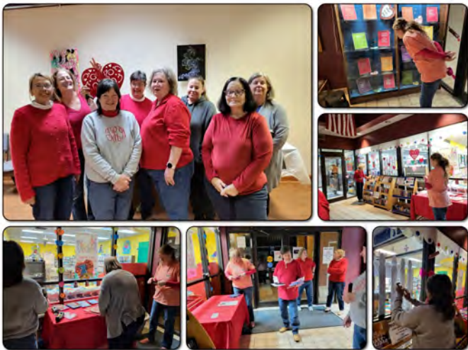
The GFWC Sylvania Junior Woman's Club went "Go Red for Women" at their Board meeting on February 1. Afterwards, they helped put up a Valentine's table at the Screven County Library and viewed the library's display for Library Lovers' Month.