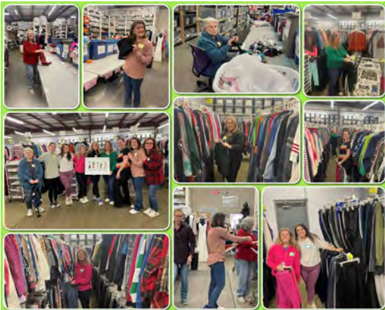
Nine members of the GFWC Roswell Cares Service League and their guests enjoyed a day at Foster Care Support Foundation, Inc., an organization that serves a vital and growing need throughout Georgia by providing free clothing, infant equipment, and developmental toys to thousands of children in foster and relative care. The club sorted, sized, shelved, and restocked clothing in their store.